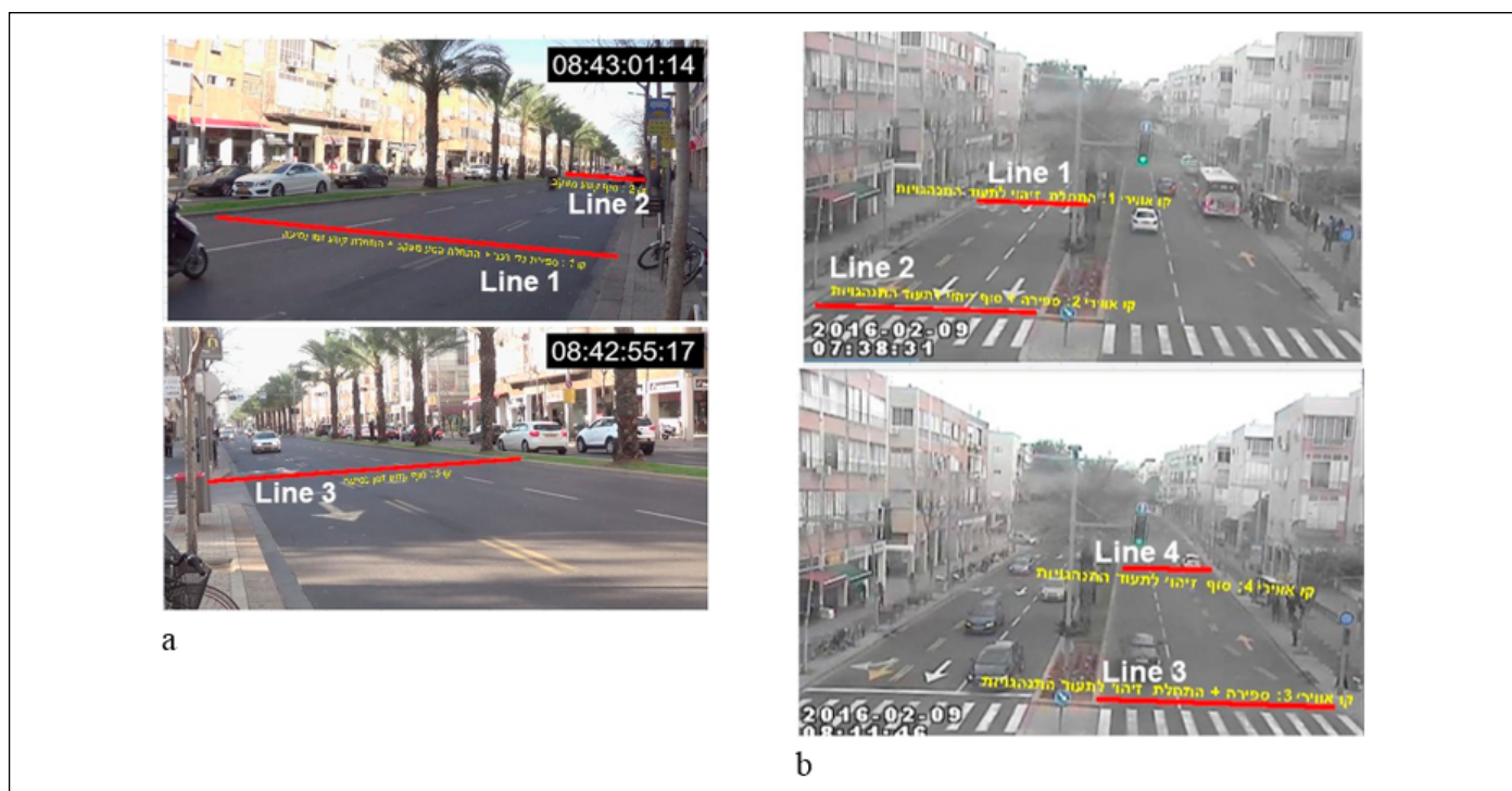
Figure 2. Examples of definitions of follow-up windows for data preparation: a – on section camera films (Site 2), b – on junction camera films (J77).

iors behind the buses which stopped at the bus stops were prepared, following the rules described above for the use of section camera films.