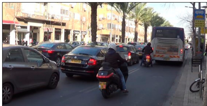
Figure 3. An example of PTW appearance behind a bus stopping at the bus stop.

As indicated in Sec.2, special attention in the study was devoted to the situations where a PTW appeared behind a bus stopping at a bus stop - see example in Figure 3. For a detailed examination of this issue, specific data samples were collected for the study sites with bus stops – Sites 2-4. The data revealed that such occurrences were common only at Sites 2 and 4; Table 7 provides a summary of findings at those sites. It should be noted that at Site 2, the bus stop was on the bus lane (no bay), while at Site 4, the bus stop was in a bay near the bus lane.