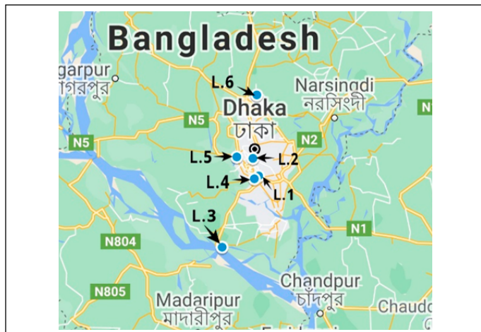
Figure 1. Locations of the Study.